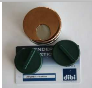
Kit defender "Key Protector" with keys and card